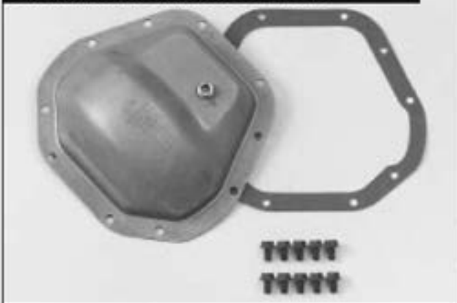
DIFFERENTIAL CARRIER COVER KIT