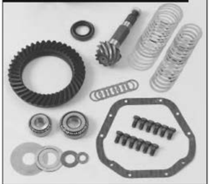
CROWN & PINION KIT