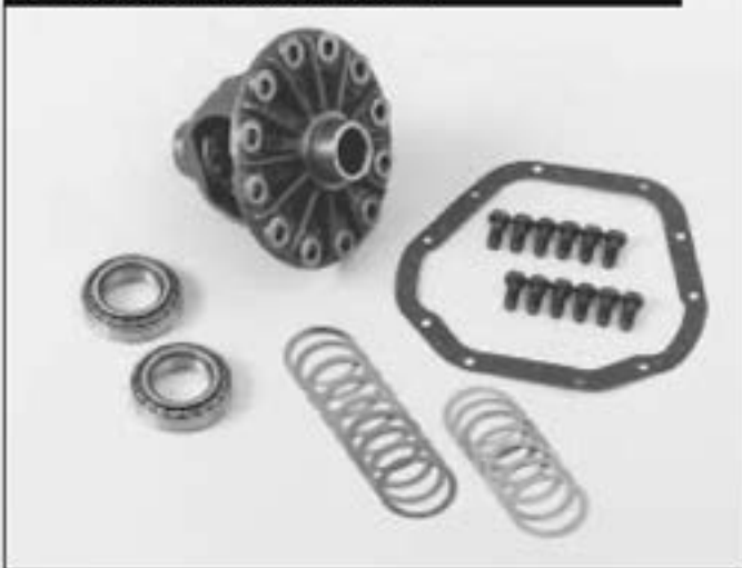
DIFFERENTIAL CASE LOADED